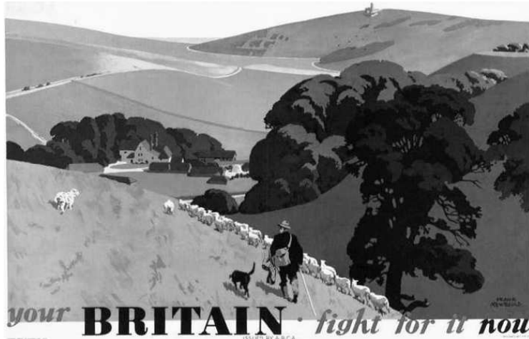
FIGURE 3 A British war poster of Birling Gap, South Downs, East Sussex. "Your Britain, fight for it now," lithograph by Frank Newbould, 1942.

The landscape, however, is a contested domain. "Arguments about the aesthetics of landscape were almost always arguments about politics" (Everett 1994). In the past there were conflicts between rich and poor, e.g., at the time of the Enclosures. Today the landscape is the scene of many battles, e.g., over the erection of wind-farms. "The contemporary adulation of the picturesque is duplicitous as it idealizes a landscape of make-believe as part of a forlorn protest against modern industrial progress" (Daniels 1988). Often the past is romanticized with an emphasis on preserving landscapes of power, such as the portfolio of properties held by the National Trust, many of which are English Landscape Gardens of the eighteenth century. Such gardens in their own day carried very clear political messages. Not infrequently the village people were moved off the parkland so that they were no longer visible, and public roads were diverted outside the boundary. Then what had been an agriculturally productive landscape was set aside purely for aesthetic pleasure, demonstrating that the owner had amassed so much wealth from industry that he could afford to forgo the income from the land. These landscapes themselves harked back to a pre-industrial, pre-agrarian even, age. Yet, whatever their political dynamic, such parkland landscapes are now the subject of renewed nature conservation interest as they are among the best sites for veteran trees.