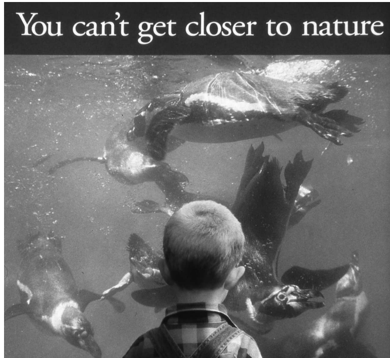
FIGURE 2 The Colchester Zoo poster.

penguins with the caption “You can’t get closer to nature.” This image epitomizes the concept of nature as biodiversity.